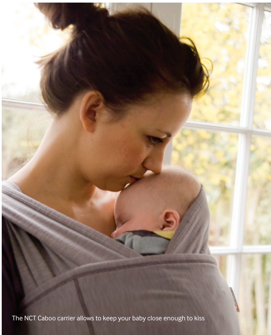
The NCT Caboo carrier allows to keep your baby close enough to kiss

Ring slings are pieces of cloth with two rings sewn at one end. The free end is looped through the rings, forming a pouch for the baby, with the tail of the fabric hanging down. They are worn over one