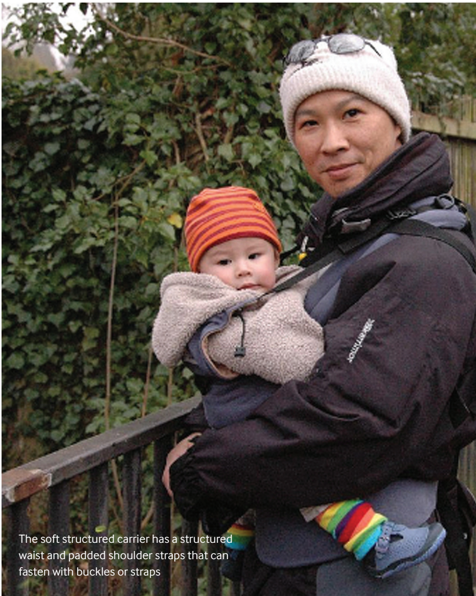
The soft structured carrier has a structured waist and padded shoulder straps that can fasten with buckles or straps

sling or carrier should not close around them so you have to open it to check on them. In a cradle position your baby should face upwards not be turned in towards your body.