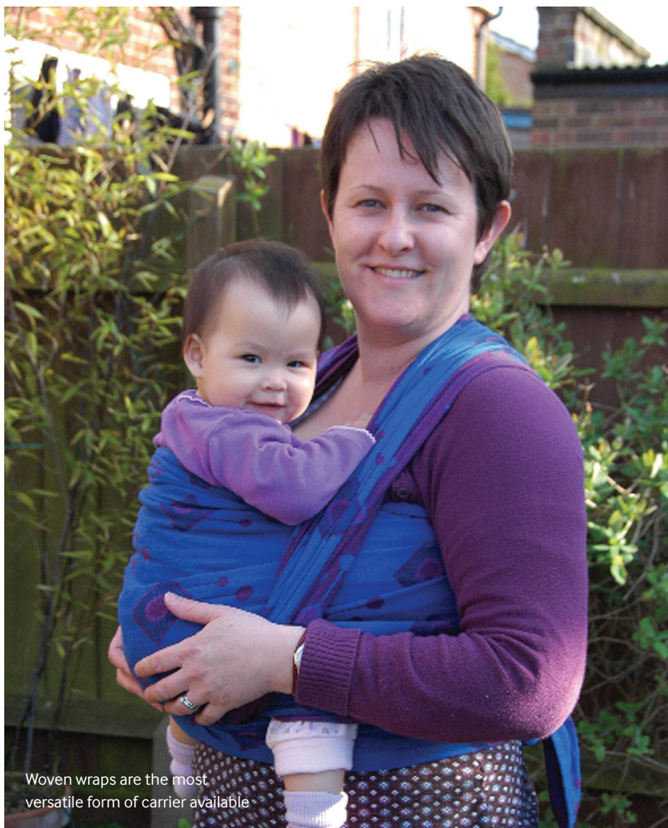
Woven wraps are the most versatile form of carrier available

As a practitioner, you may also decide to train as a babywearing consultant. Courses are available from four different babywearing schools in the UK: Trageschule UK ( www.trageschule.co.uk ), The School of Babywearing ( www.schoolofbabywearing.com ), Slingababy ( www.slingababy.co.uk ), and JPMBB ( http://jeporitemonbebe.com ).