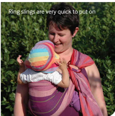
Ring slings are very quick to put on

A baby in a cradle carry in a pouch or ring sling should be positioned carefully with their bottom in the deepest part so the sling does not fold them in half pressing their chin to their chest. These guidelines are downloadable as a PDF from www.naturalmamas.co.uk/wp-content/uploads/2012/03/TICKS2.pdf