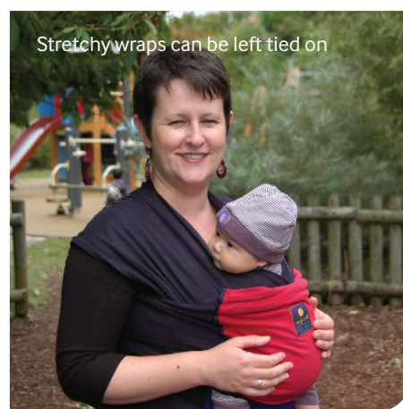
Stretchy wraps can be left tied on

shoulder. They are very quick to put on but require rigorous learning to get the adjustment right. The rings offer more adjustability than a pouch. Unpadded ring slings are easier to adjust, and the ones made out of woven wrap material are the comfiest to use.