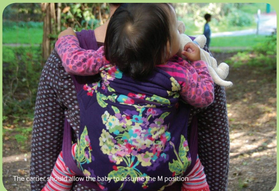
The carrier should allow the baby to assume the M position

There is a plethora of baby carriers available. The range of baby carriers