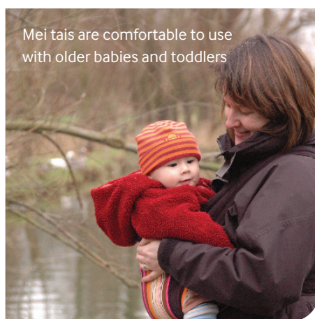
Mei tais are comfortable to use with older babies and toddlers