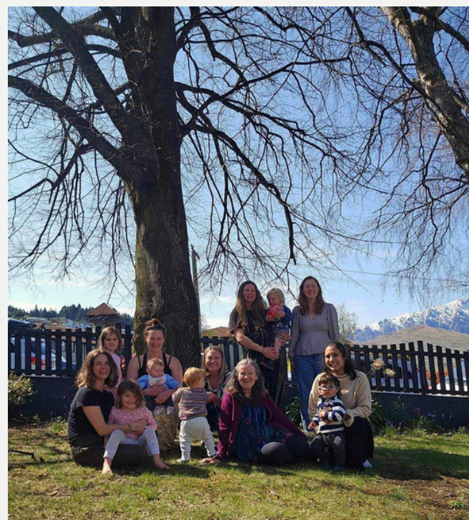
Photo above of the Queenstown and Central Lakes Homebirth support group at their September gathering.

WANT TO SEE YOUR REGION HERE? PLEASE SEND US AN EMAIL.